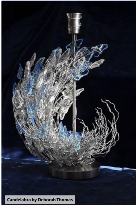
Candelabra by Deborah Thomas

It is expected that the Downing Street display will be ongoing and will be changed every few months.