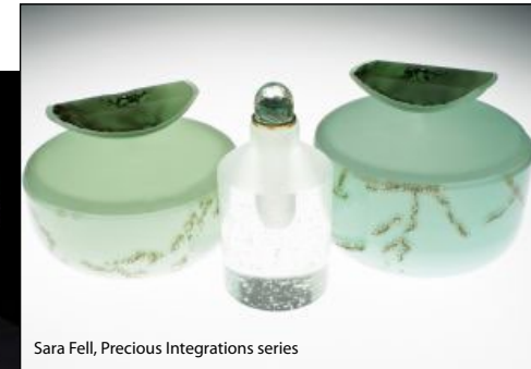
Sara Fell, Precious Integrations series