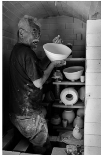
Renowned Japanese potter Koie Ryoji during his residency at Leach Pottery.

'A Day at the Leach Pottery' will be held on Sunday 23 October between 1pm and 6pm at the Nippon Club , 1st floor, Samuel House, 6 St Albans Street, London SW1Y 4SQ