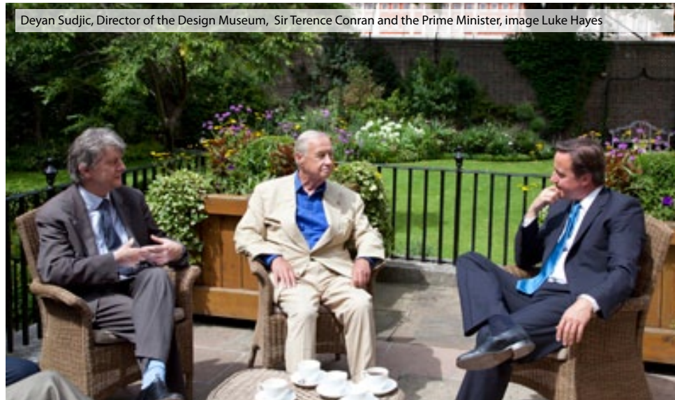
Deyan Sudjic, Director of the Design Museum, Sir Terence Conran and the Prime Minister

The Design Museum is celebrating Sir Terence Conran's career with a retrospective exhibition – Sir Terence Conran, The Way we Live Now, 16 November 2011 - 4 March 2012.