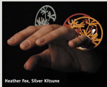
Heather Fox, Silver Kitsune